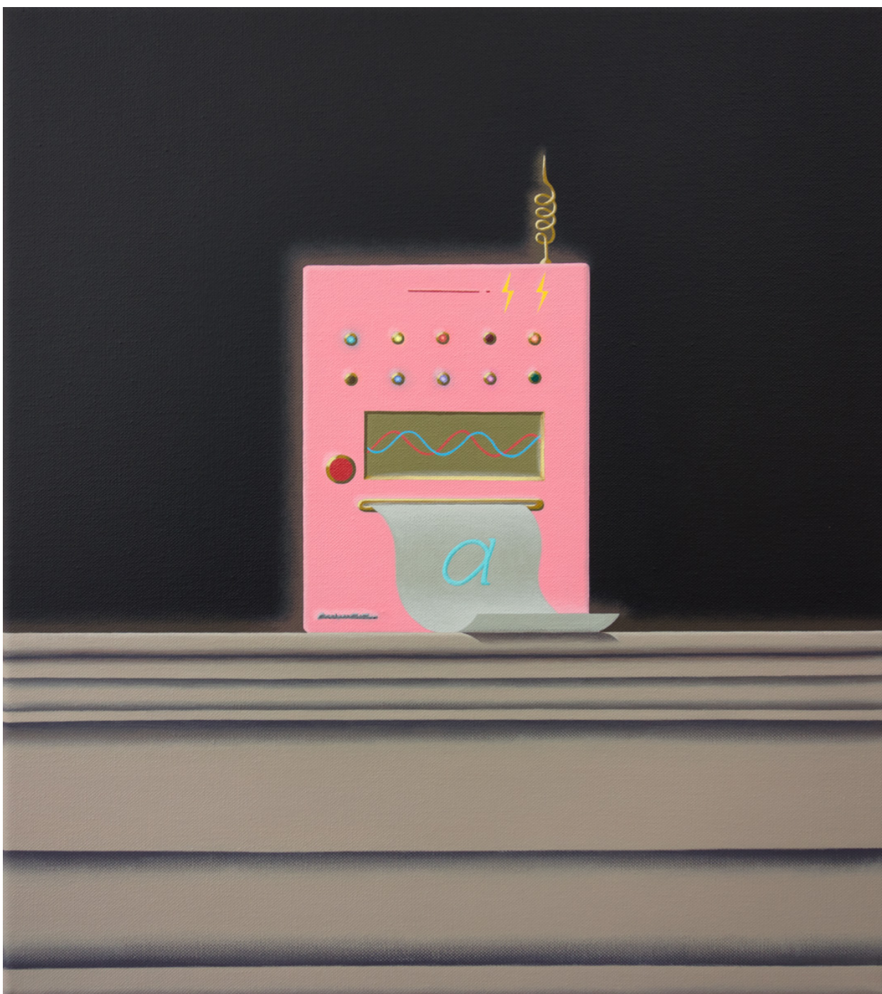
Pedro Ruxa Tranquility base #2 Pink Transistor , 2021 Acrylic on canvas 45 x 40 cm