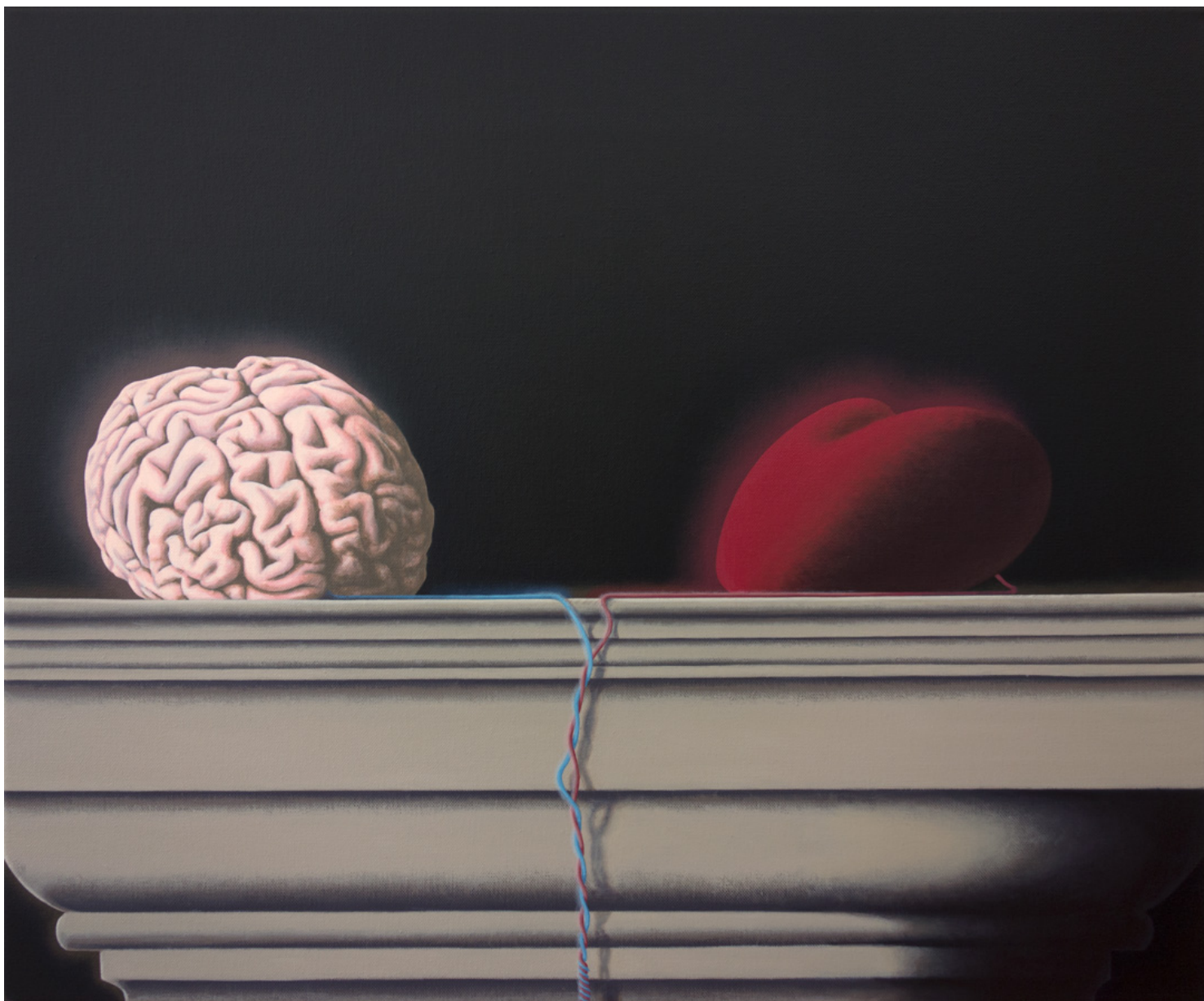
Pedro Ruxa Tranquility base #3 Tranquility , 2021 Acrylic on canvas 50 x 60 cm